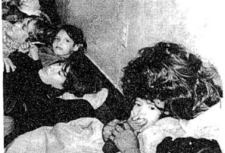
Homeless people waiting at the Emergency Assistance Center in New York City. Hundreds of city welfare workers try to find temporary space for them.