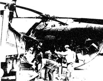
NOVETS HELP DELIVER U.S. FARMER SUPPLIES IN Somalia. Helicopters from the United States are loaded onto a Soviet helicopter to help deliver emergency 'Aid'.