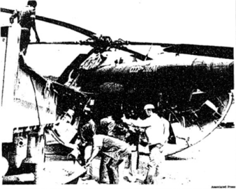
SOVIETS HELP TO DELIVER U.S. FARMER SUPPLIES In Romania, a Romanian soldier from the United States is loaded onto a Soviet helicopter to help deliver emergency grain.

VOL. CXXIV... No. 46,232 Copyright © 1984 by The New York Times Company NEW YORK, MONDAY, NOVEMBER 19, 1984 39 CENTS