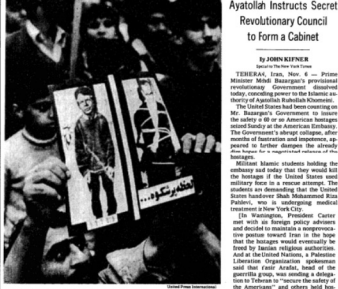
In Tehran, a demonstrator held up pictures with the faces of President Carter and the Shah of Iran superimposed on faces of victims of the firing squad.

STUDENTS WARN U.S. Ayatollah Instructs Council to Form a Cabinet